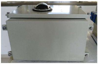
Electro Mechanical Actuator Mechanism for GIS (Switch Gear – Power Distribution Industry)